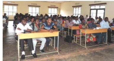
Students attending Hon. Musabeyezu's lecture

Another speaker, Senator Narcisse Musabeyezu, a member of the Rwandan Senate talked about quality of education in Higher Learning Institutions and recommends UNIK students to target quality education, not just degrees.