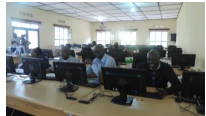
Lecturers uploading their courses on Moodle

We always recognize that learning is not just theories. We always strive to help our students link theories to practices. With the renovation of Musamvu houses, smart irrigation is underway. Students are being taught how to prepare dams for retaining water from houses for irrigation and how to make fish ponds.