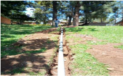
Smart irrigation construction at UNIK Musamvu

In the same vein, through "Tax Justice Network Africa" students from the Faculty of Economics and Business Studies participated in a debate on tax justice organized by "Governance for Africa". They competed with other students from various Universities across Rwanda.