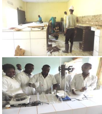
Musamvu houses renovated into beautiful labs

The future of UNIK is promising. If you consider the pace that activities are taking, it is hard to imagine that in just one month, Agriculture and science laboratories are renovated and already equipped with reagents and materials.