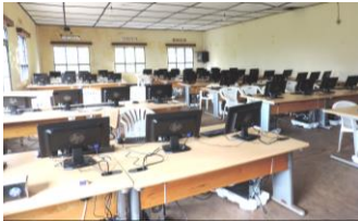
ICT lab equipped with new computers

UNIK is considerably allocating efforts in changing its image for better service delivery to all its stakeholders. With this year 2018, the UNIK management has opted to invest tremendously in building relevant infrastructure to support teaching and learning.