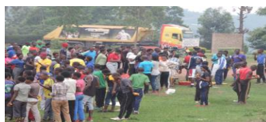
UNIK distributing mango fruits to Itorero

The University is striving to increase its social and economic impact in the Eastern region. Modern Agriculture is one of the items on the agenda in this regard. In this line, UNIK had an opportunity to visit Itorero Session 6 in Ngoma District. Through the Faculty of Agriculture and Rural Development, mango fruits are distributed to student participants (S6 Leavers). The purpose is to help Itorero participants to stay healthy, and mainly for UNIK to have mango seeds back and prepare genetics for mango propagation.