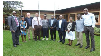
Researchers from Haute Ecole Condorcet with Rulindo Campus team

UNIK Rulindo hosts a team of researchers from Haute Ecole Condorcet (Belgium) for collaboration in staff and student research exchange.