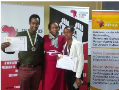
UNIK students ranked 2 nd in the debate

The focus of the University is not only on academic activities. We also get involved in other sectors