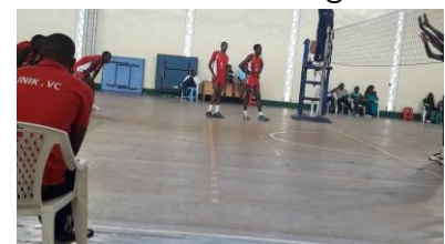
UNIK volleyball team play with IPRC-East

UNIK wants to build an integrated person and be an exemplar to fitness attraction through its volleyball team. The team is able to compete with teams in the region.