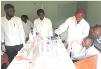
Experiments are going on in Bio-lab

The future of UNIK is promising. If you consider the pace that activities are taking, it is hard to imagine that in just one month, Agriculture and science laboratories are renovated and already equipped with reagents and materials.