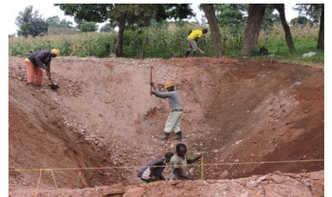
Preparation of dams for smart irrigation.

We always recognize that learning is not just theories. We always strive to help our students link theories to practices. With the renovation of Musamvu houses, smart irrigation is underway. Students are being taught how to prepare dams for retaining water from houses for irrigation and how to make fish ponds.