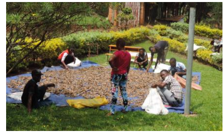
Students in the Faculty of Agriculture drying mango seeds for nursery preps

We want to lead in technology-led education. UNIK is building a tele-conference room to access and allow access to education from distant places.